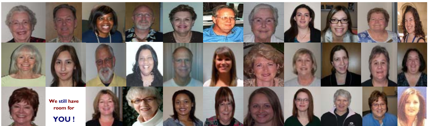
Some of the many faces that make our program thrive. THANK YOU ADVOCATES!